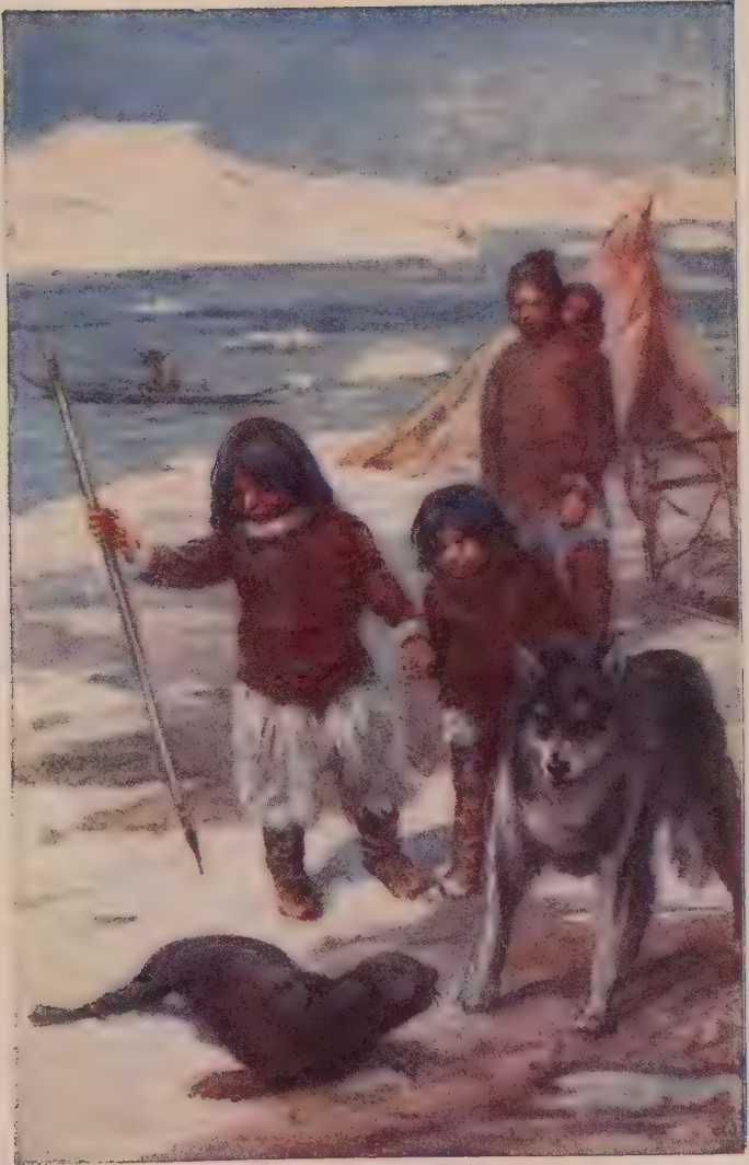
"It would have been difficult to say whether the little Esquimaux were boys or girls."